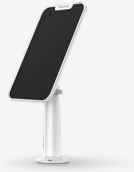
Reolink Solar Panel