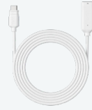
USB-C Extension Cable for Reolink Solar Panels